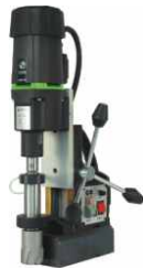
KBM 42 - 2