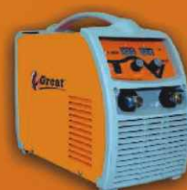
YUVA - 400