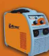
YUVA - 300