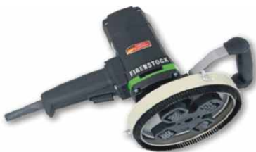
EPF 1503 Scouring Machine