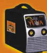
YUVA - 200 (Special Edition)