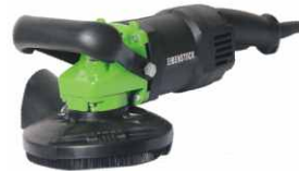
EBS 125 I Concrete Grinder 125 mm