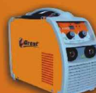
YUVA - 350D