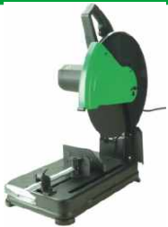
EST 355 I Chop Saw