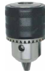
Professional Metal Chuck