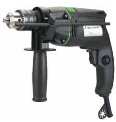
EPD 10 Plain Drill