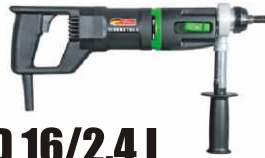
ESD 16/2.4 I Percussion Diamond Core Drill