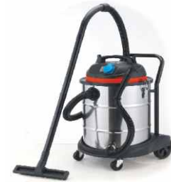
VC - 50 Wet & Dry Vaccum Cleaner