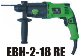
EBH-2-18 RE Rotary Hammer Drill 18 mm