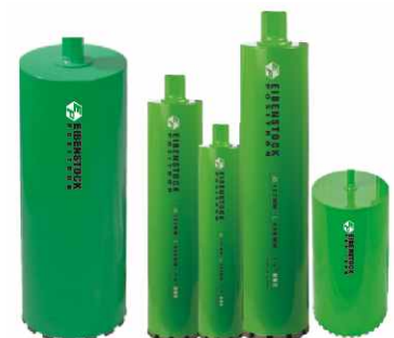
Concrete Core Bit