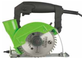
ETC 125 E1 & E2 Super Cutter Machine