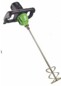
MXT 100 - 2 The Versatile Stirrer