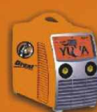
YUVA - 200