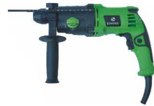
EBH-2-18 RE Rotary Hammer Drill 18 mm