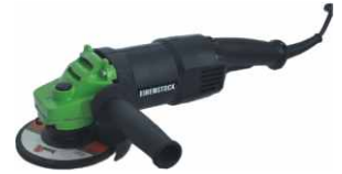
EZW 125 I Angel Grinder 125 mm