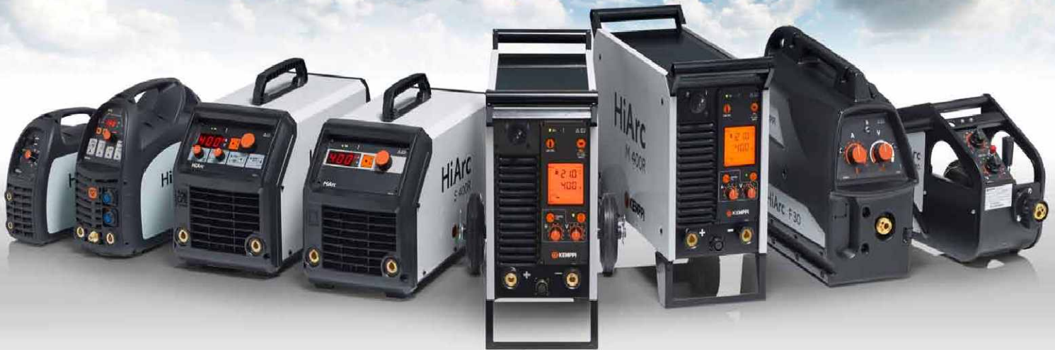
HiArc S 140

HiArc family - Tough, powerful and portable