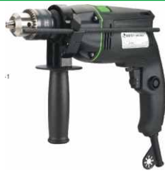
EHD 13-1 Single Speed Hammer Drill