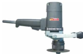
UKF 1500 Bevelling Machine