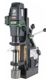
KDS 100 - 4RL