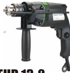
EHD 13-2 Double Speed Hammer Drill